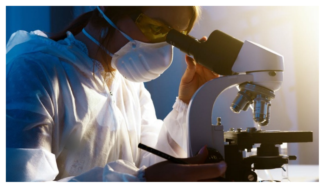
A promising approach for aging research

Scientists have decoded a molecular mechanism that could have an impact on aging