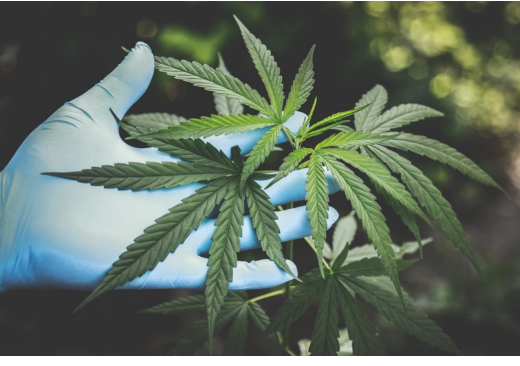
Heavy marijuana use may fuel anxiety disorders, new research finds. This age group is most at risk

Increased anxiety has well-known negative effects on our health as we age