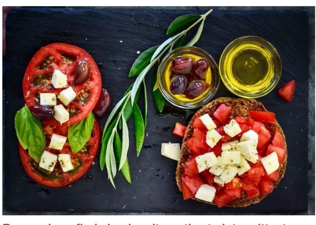
Researchers find simpler alternative to intermittent fasting

Intermittent fasting can be very effective, but difficult. An easier alternative could benefit many people.