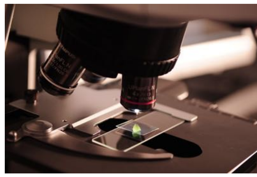
'Zombie' cells may hold clues to improving old age

A detailed look at the study of cellular senescence, which may be a key component of aging