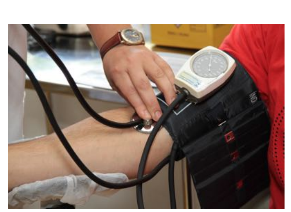
Evidence of a casual relationship between vitamin D deficiency and hypertension: a family-based study

New research indicates that a long suspected relationship between vitamin D deficiency and hypertension may be confirmed