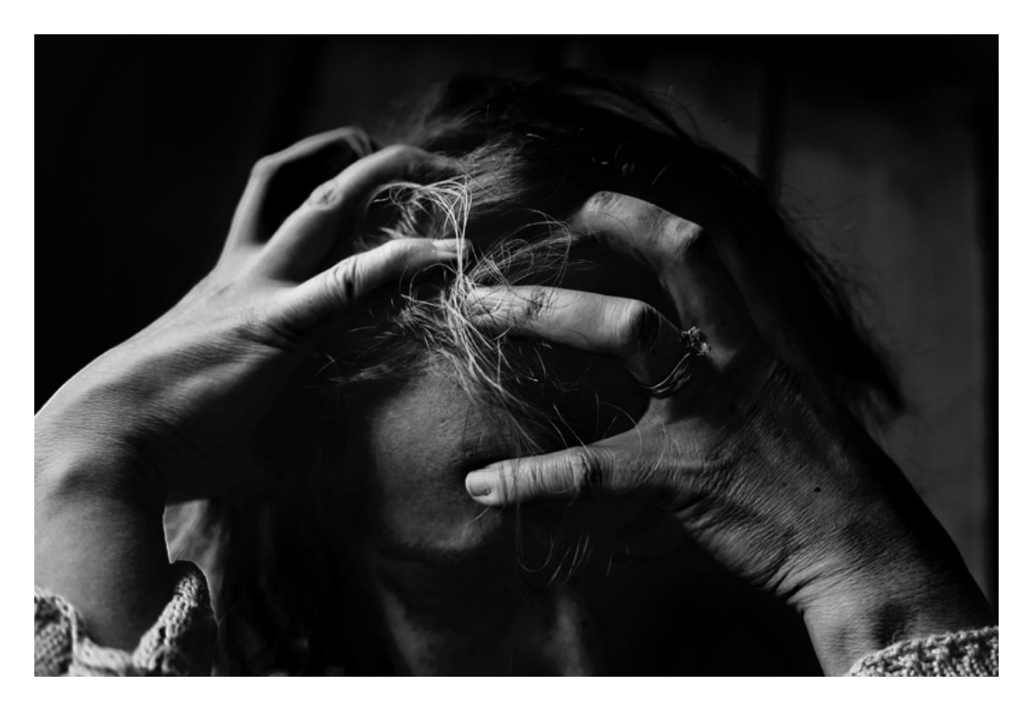
Impact of loneliness in old age on life expectancy

A new study finds that loneliness in old age has real consequences on lifespan.