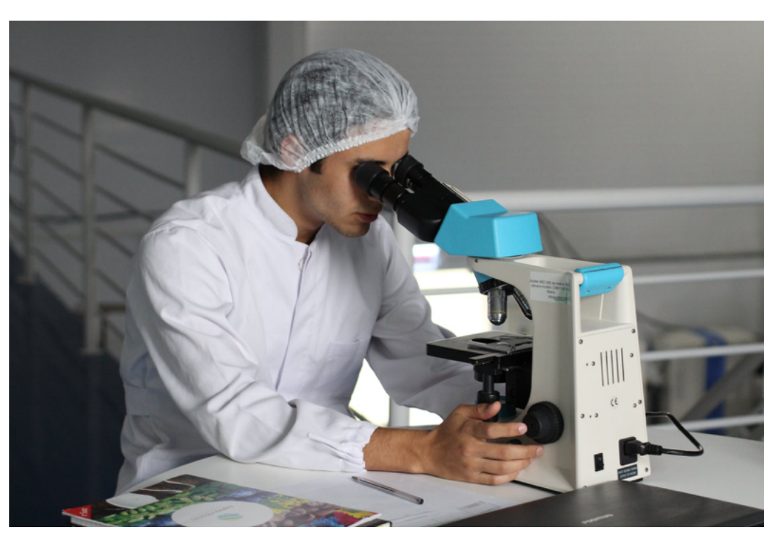
Science of Aging is Focus of New Bakar Research Institute

The Bakar Aging Research Institute is a new project from UC San Francisco aimed at developing new treatments & approaches to help people remain healthy later in life.