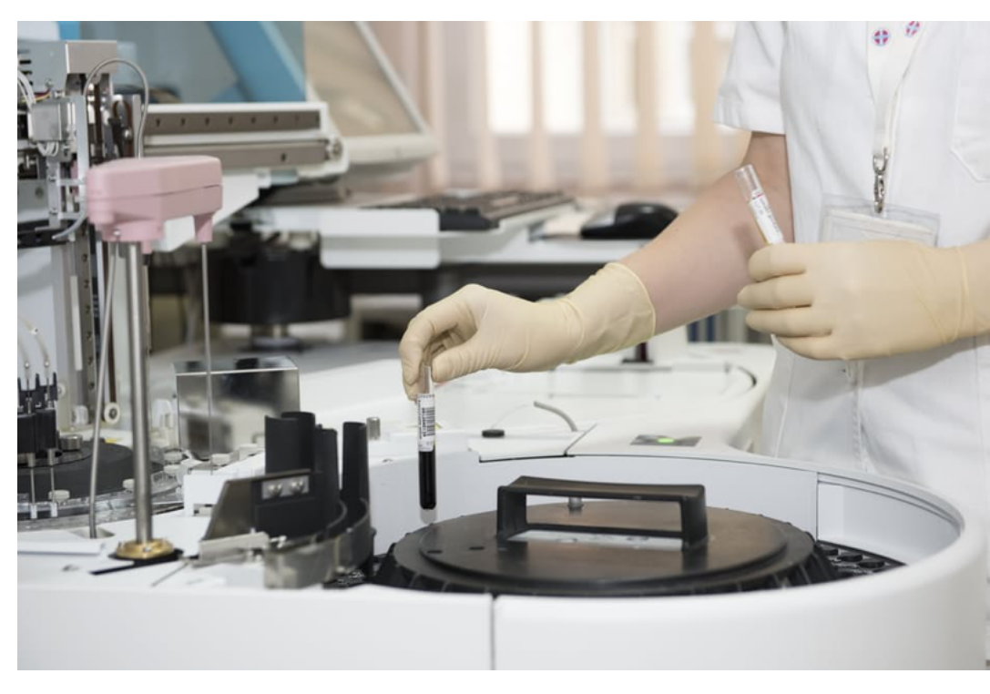
Research on aging expands at U-M with $15M in new grants

New grants expand aging research at the University of Michigan, aimed at solving problems that affects older adults.