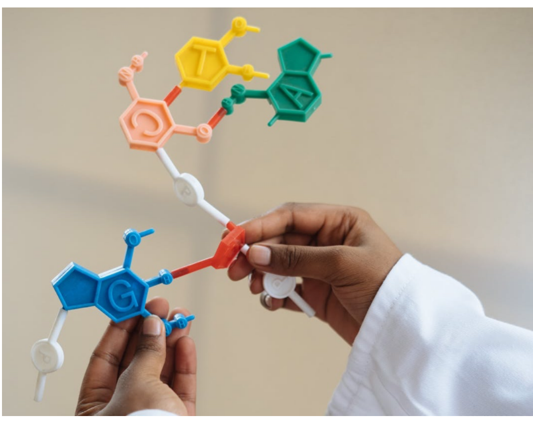
$6M Grant Awarded for Research Into Role of Aging in Parkinson's

A new grant aims to understand the molecular connections between aging and Parkinson's disease.