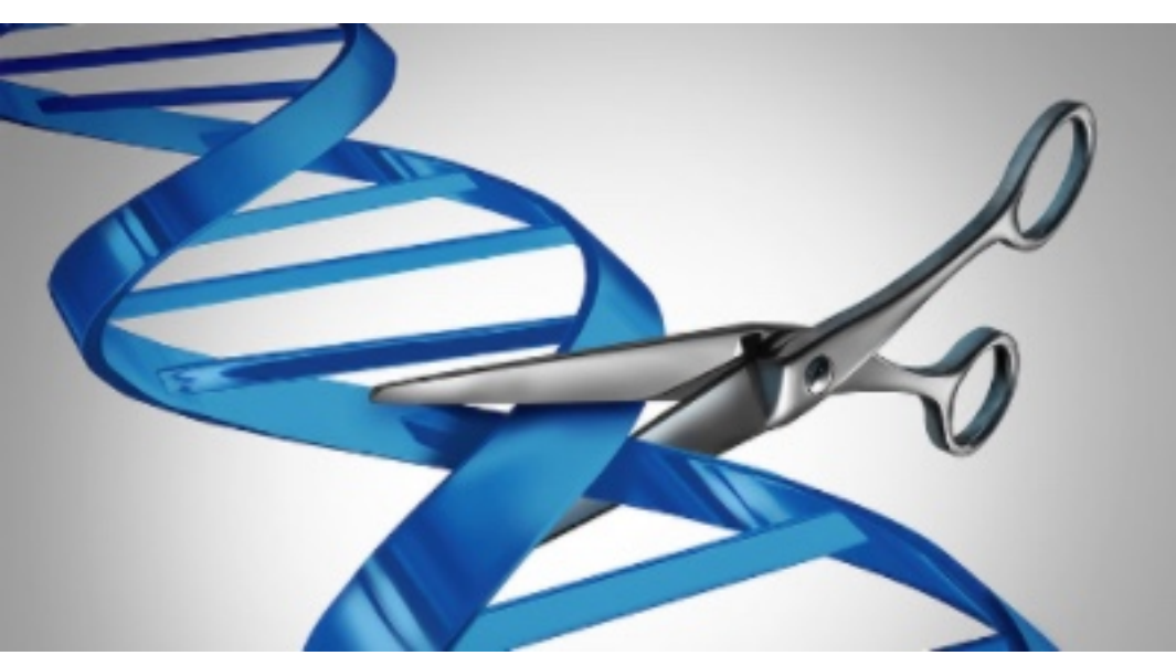
Understanding the effect of aging on the genome

New research hopes to understand the effects of aging on the genome, which affects cellular development across entire organisms.