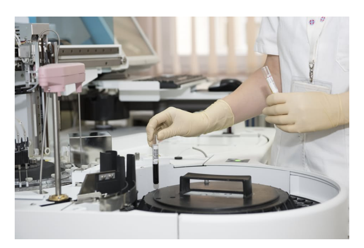
California researchers develop drug cocktail that reverses aging — results 'remarkably promising'

Volunteers were found to "Age backwards", reducing biological age by 2.5 years