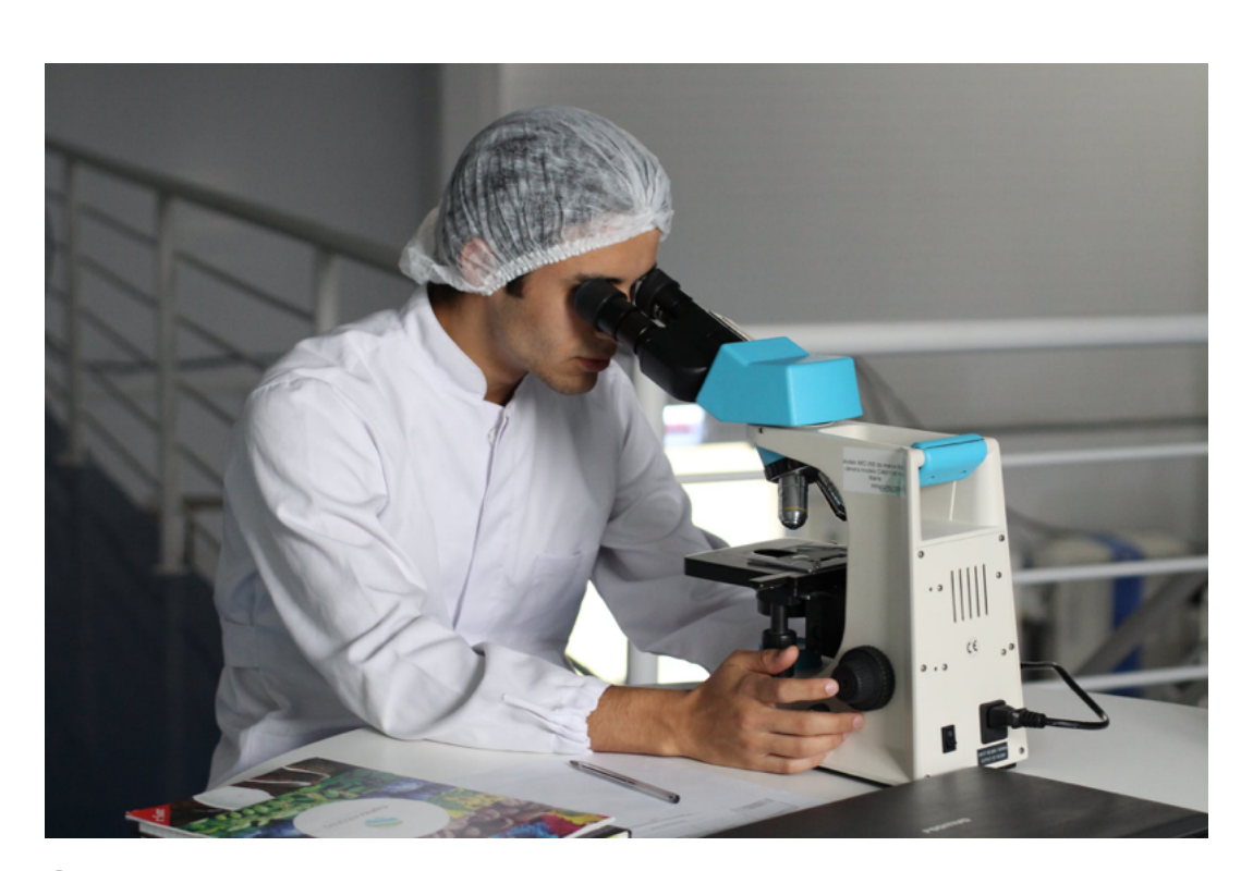
Scientists may have found a way to reverse aging in new drug trial

A recent study on a new drug cocktail has produced positive results in reversing the aging process.