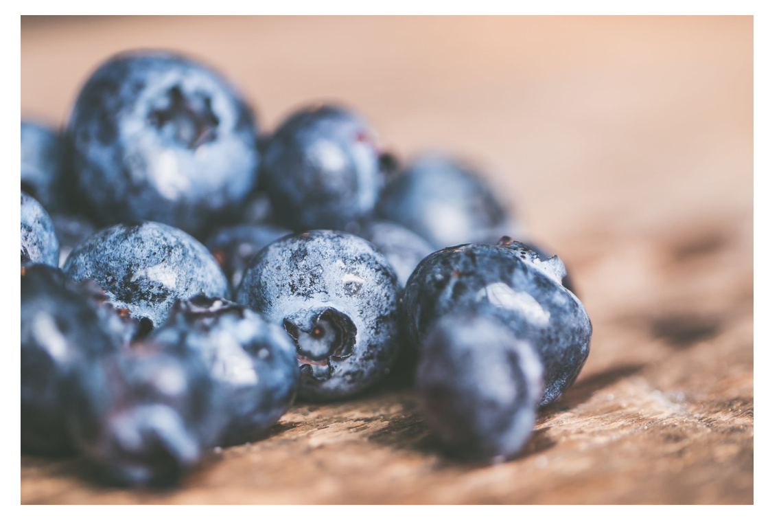
Blueberries offer a wide variety of remarkable health benefits

New research shows that adding blueberries to your diet may have significant health benefits