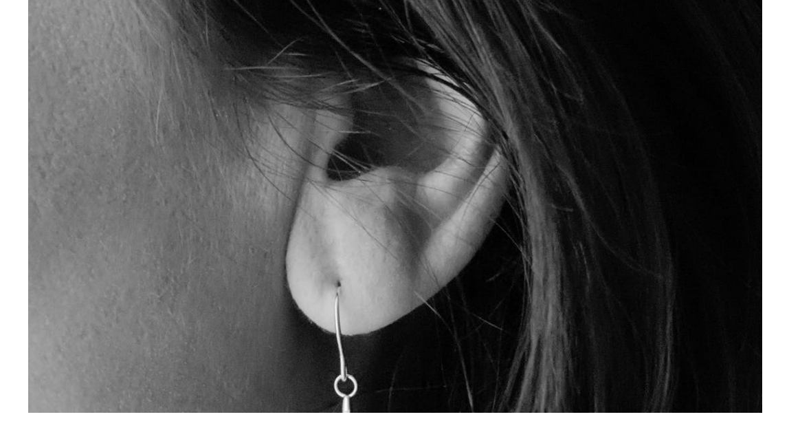
'Tickle' therapy could help slow aging, research suggests

A new, simple type of therapy could slow certain aging processes in those over 55